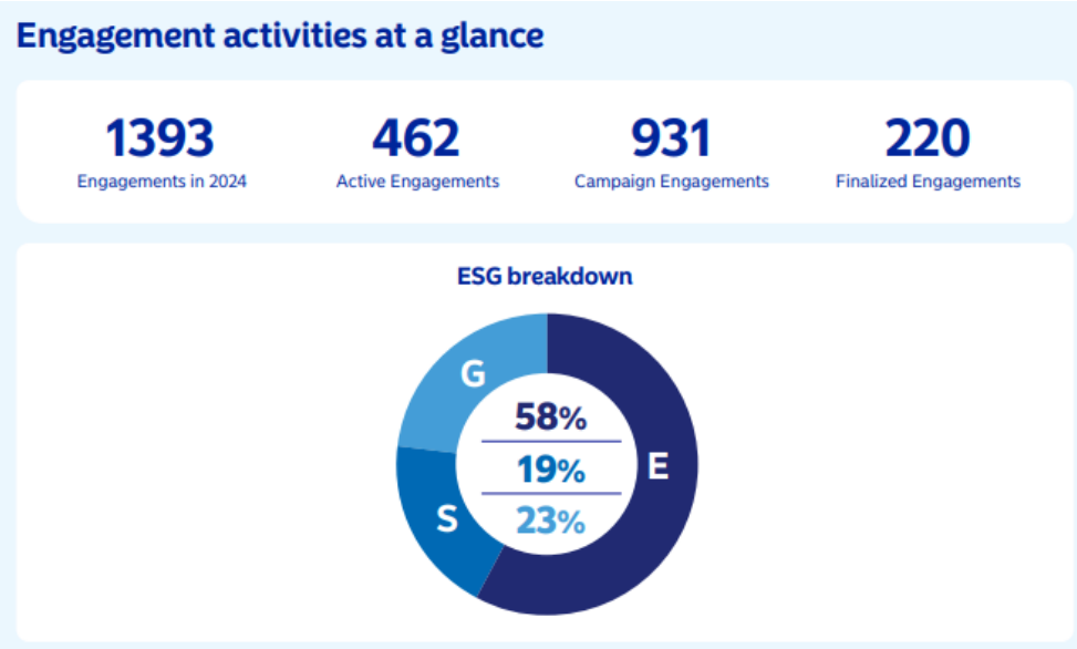
Figure 2: Voting activities in 2024